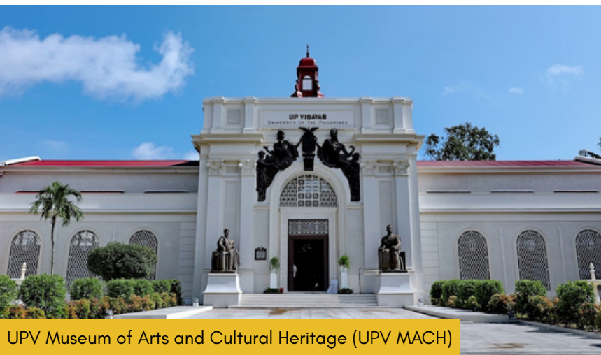
UPV Museum of Arts and Cultural Heritage (UPV MACH)

Together, we can experience Iloilo's powerful blend of creativity, innovation, and history!